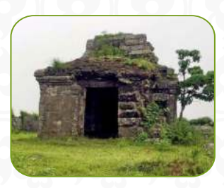
Mangala Devi Kannagi Temple